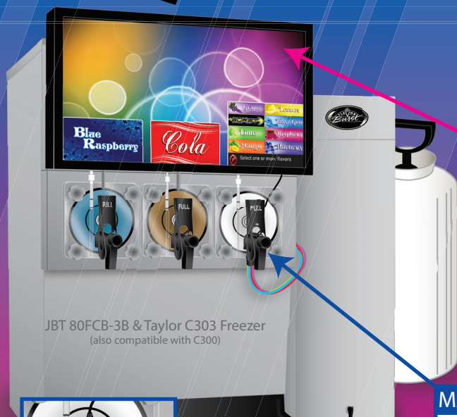
JBT 80FCB-3B & Taylor C303 Freezer (also compatible with C300)