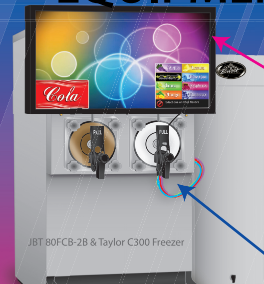
JBT 80FCB-2B & Taylor C300 Freezer