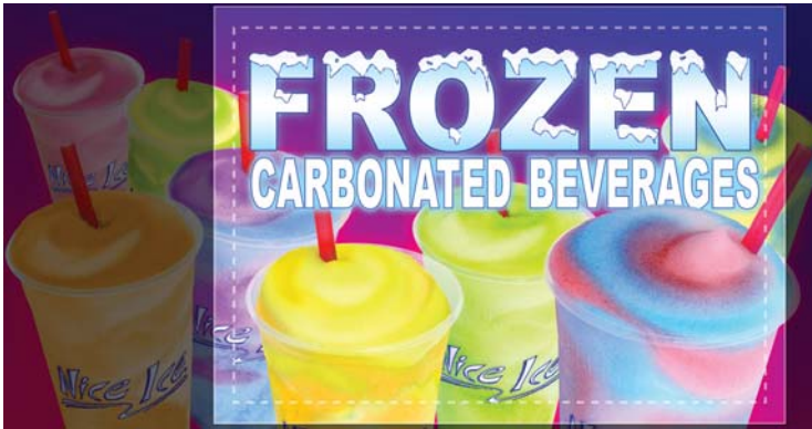
TAYLOR MODELS No. C303 (standard version)

DIE CUT: 22.125" w x 16.188" h LIVE AREA: 20.563" w x 14.50" h