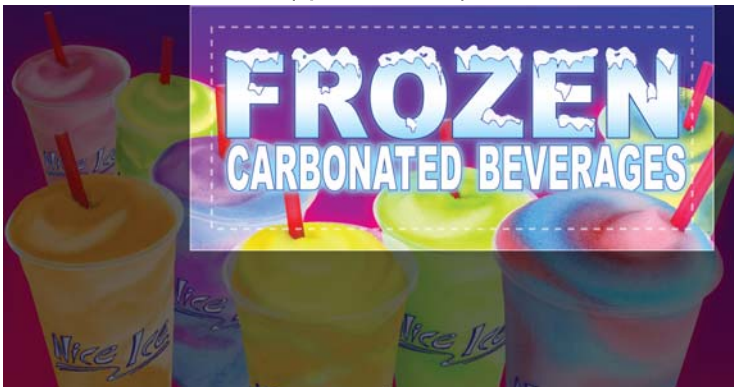
TAYLOR MODELS No. C303 (optional version)

DIE CUT: 22.44" w x 10.50" h LIVE AREA: 20.57" w x 8.63" h