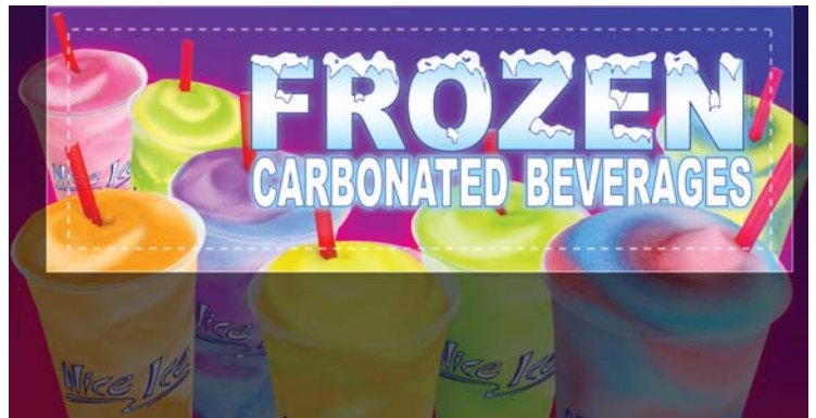
TAYLOR MODEL No. C314 (optional version)

DIE CUT: 29.375" w x 10.50" h LIVE AREA: 27.630" w x 8.630" h