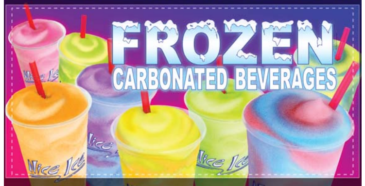
TAYLOR MODEL No. 349 & C302 Serial # ending with M0122232

DIE CUT: 31.125" w x 15.250" h LIVE AREA: 30.0" w x 14.625" h